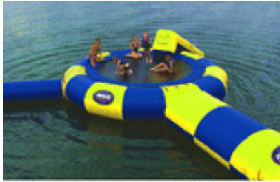
T10-106 (5m diameter)